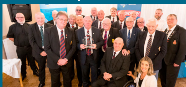
Merthyr Valley Veterans