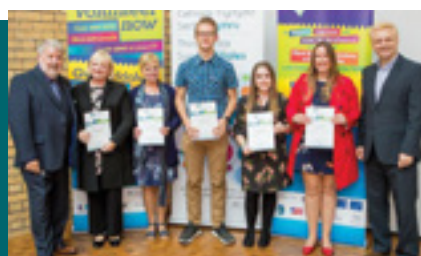
Stephens and George Charitable Trust