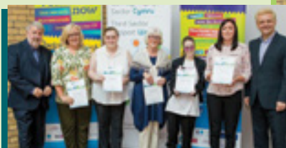
Safer Merthyr Tydfil