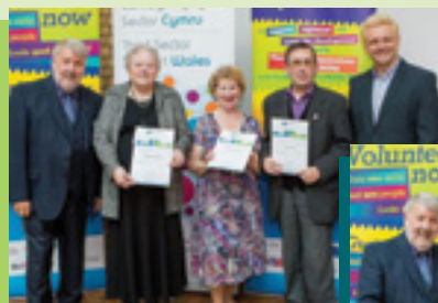
Merthyr Tydfil Historical Society