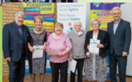
Merthyr Tydfil Borough Credit Union