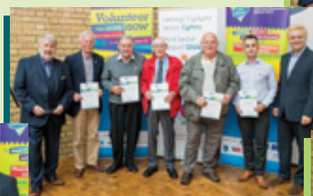
Merthyr Tydfil Angling Association