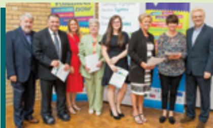
Prince Charles Hospital