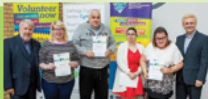
MTIB Leap Project