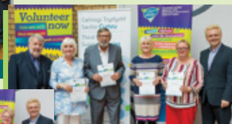
Patient Support Group