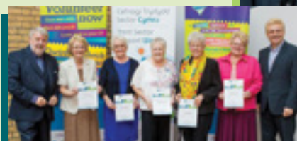
Pentrebach and Abercanaid Old Age