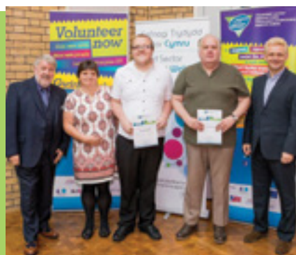
Merthyr Tydfil Leisure Trust