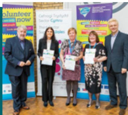
Tenovus Cancer Care